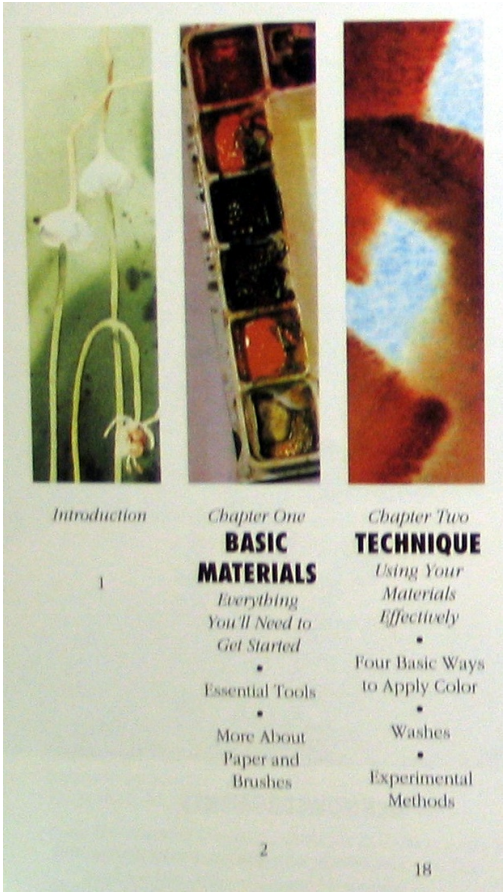
Figure 8. Portion of a TOC that extends further to the right. The visual structure is columnar, but not tabular. Each column represents a chapter, with chapter number, title, bullet separated list of sections, and chapter locator.

can be represented as a tree of ordered pairs: ( descriptor , locator ), while enforcing sibling ordering in the tree.